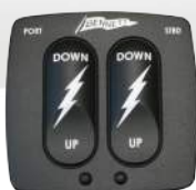
Rocker Control BCN6000