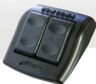
Euro-Style Rocker BRC4000