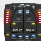
AutoTrim Pro Control Call for details

Bennett Marine invented the electric trim tab in 1960 and now continues to lead the way with a brand new electric trim tab system designed to outperform and outlast any electric system on the market.