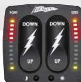
Rocker Control w/Indication