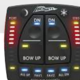
AutoTrim Pro Control

Bennett Marine invented the electric trim tab in 1960 and now continues to lead the way with a brand new electric trim tab system designed to outperform and outlast any electric system on the market.